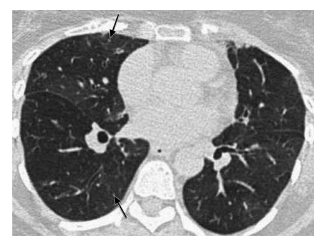
FIGURE 3. High resolution CT of the chest, where ground glass opacities and nodular lesions.