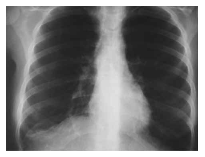
FIGURE 2. Chest X-ray upon admission to the Department, without significant findings.